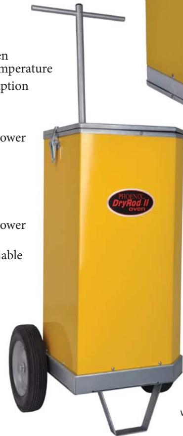
Type 5 with wheels